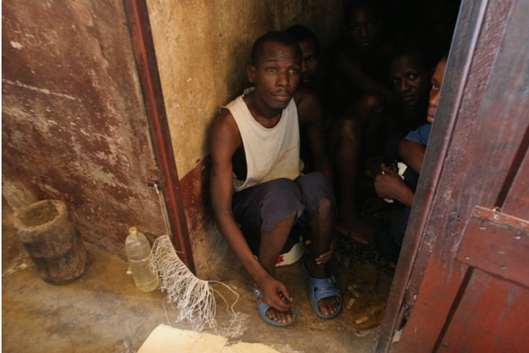
Prisoners in the Maison Centrale look out of an overcrowded, dimly-lit cell.