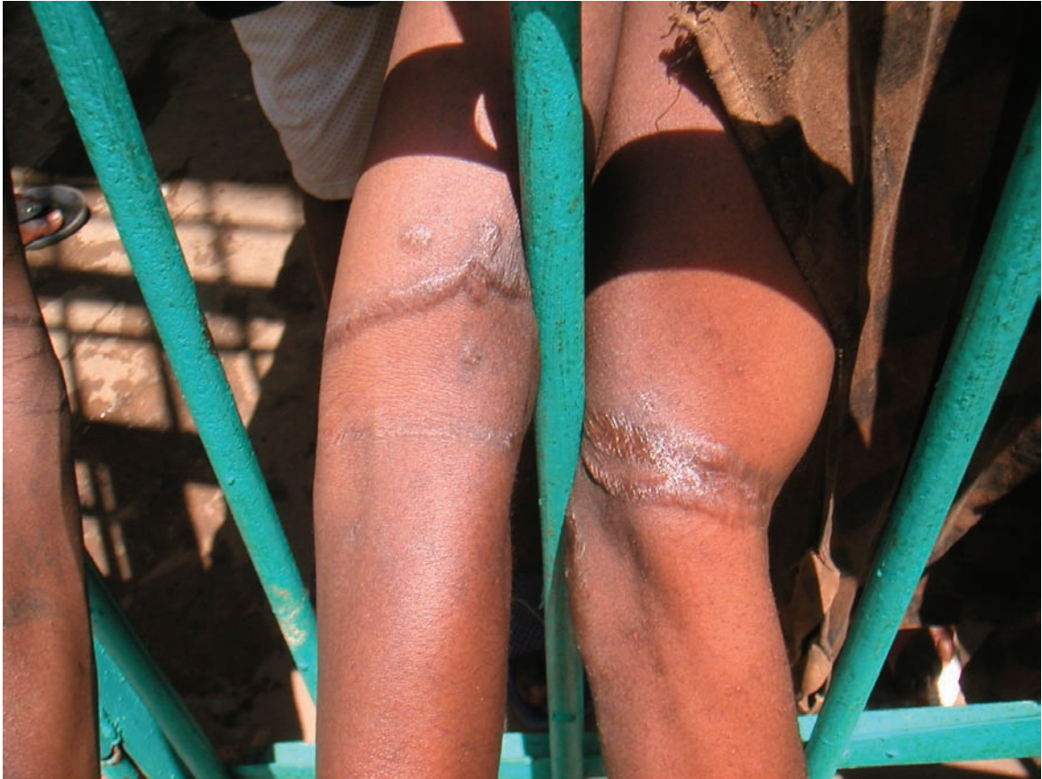
Prisoners in the Maison Centrale in Conakry bear scars that they say are a result of being bound with cords and hung in the air as part of a torture technique used during police interrogation.

returned to their hands even years after being suspended. According to a local human rights defender, such techniques date back to the Sékou Touré period. 15